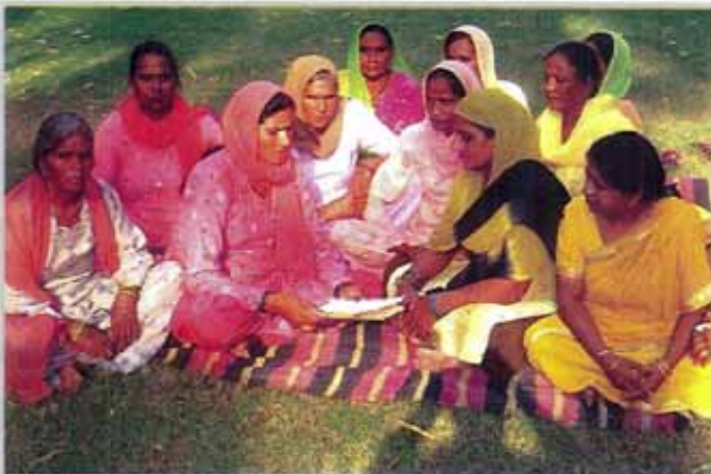
Elected women representatives discussing their powers and responsibilities.

Social awareness and their enhanced abilities to take decisions have motivated women to contest elections for posts in panchayats and become a Panch or Sarpanch. During State Panchayat