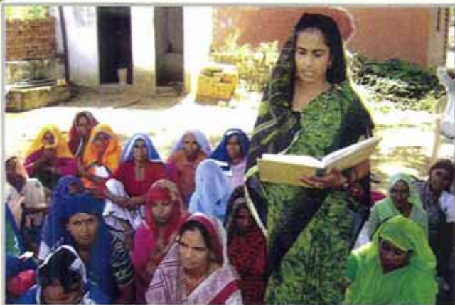
Meeting of Federation members.

the better future of the village children and now the school teachers are conducting classes properly.