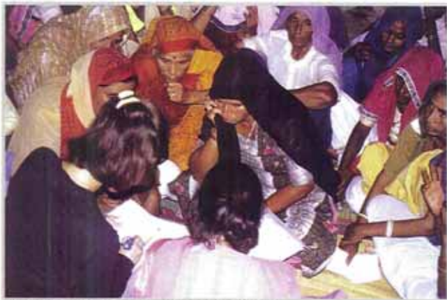
SHG members learning participatory planning.

Under the project, formation of Self Help Groups of women have provided them a collective forum and expanded their social relationship network. Initially SHG members have been imparted training on SHG concept and management and skill upgradation. SHG members meet once or twice a month to discuss various issues related to women and overall development of the village. It has led to their economic empowerment through savings and initiation of micro-enterprises at individual and joint level, functional literacy training, organic farming by promoting vermicomposting and capacity building of the women through various training and exposure visits. After an initial six months, if the performance of SHGs is satisfactory, they are provided a matching grant of Rs. 2500 to boost their morale, the only direct monetary benefit given to SHGs by the project.