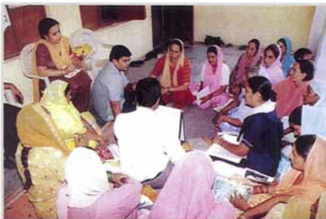
Project staff interacting with women.

isolation and exploitation. Regular training is conducted to develop and enhance their skills to run their organization.