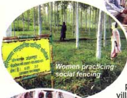
Women practicing social fencing