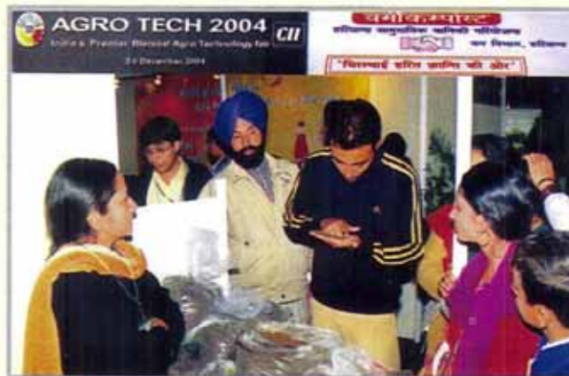
SHG women at sales counter.

Cohesion and collective strength has lead to recognition and self-esteem of women. Along with positive changes in the level of confidence, women