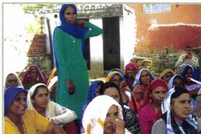
Trying to put their point strongly and collectively.

The SHG women have started taking initiatives for providing justice to village women, especially widowed and poor women. In village Rawalwas Kalan a dispute between the ex-chairman of the VRMC and the present chairman got so serious that their case went to court for decision. Women intervened and resolved the conflict at village level. Similarly in Bharaf village SHG members resolved a conflict between two families. In village Dhana Ladanpur members resolved a conflict between Harijan and Rajput community. In Jatusana Division group members were able to get back land of a poor widow as her relatives were grabbing her land. It