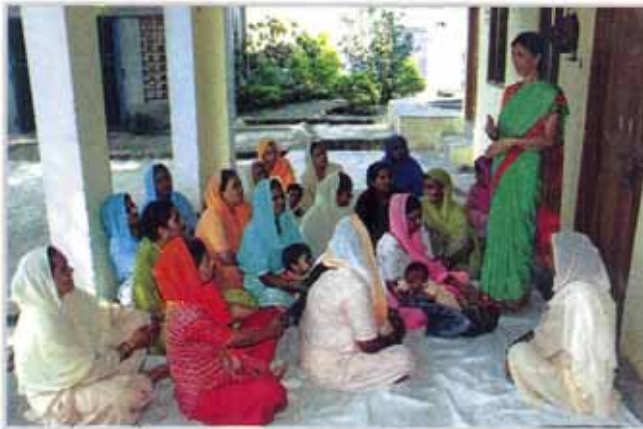
Cluster president discussing sanitation programme.

So far about 170 Self Help Groups in 100 villages have been formed with the active support of the project. The total number of members exceeds 2,000 and cumulative savings of the members are Rs. 35,42,769 Cumulative inter-lending among members for productive purposes, emergency needs and domestic needs is Rs. 44,28,375, out of