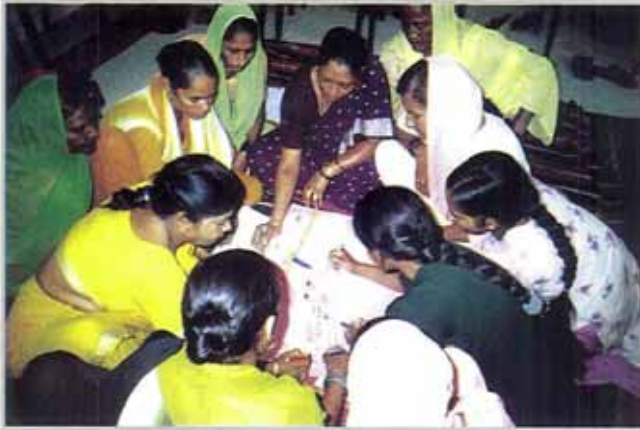
Learning to make village development plan.